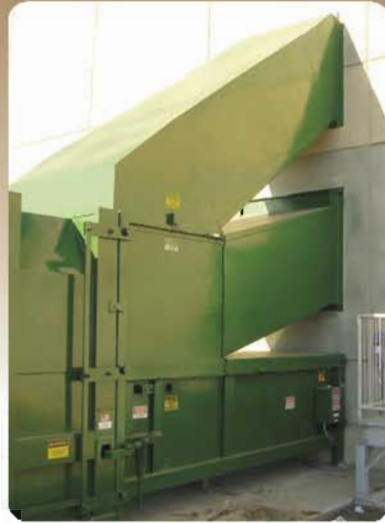
Rear Feed with Dual Through-The-Wall Feed Option