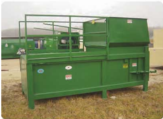
Walk-On Dock Mount