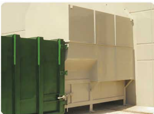
Walk-On Full Enclosure (8' Wide)