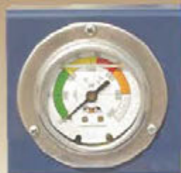
Color Coded Pressure Gauge