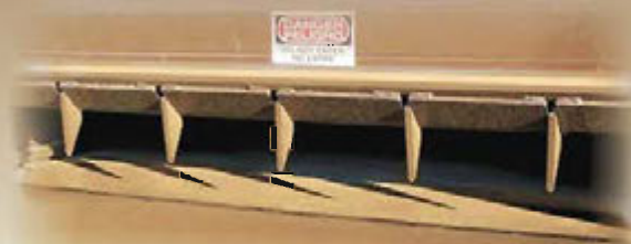
Hinged Breaker Bar Teeth