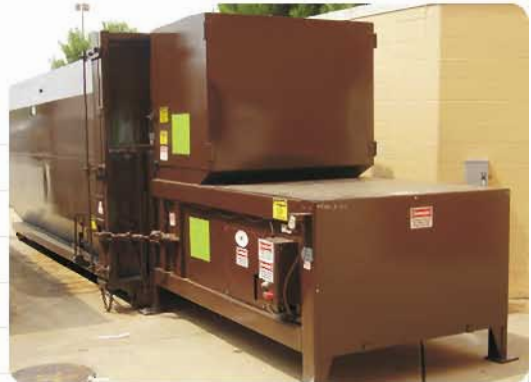
Enclosed Hopper with Side Feed Door