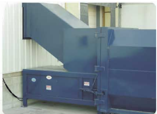
Rear Load Through-The-Wall